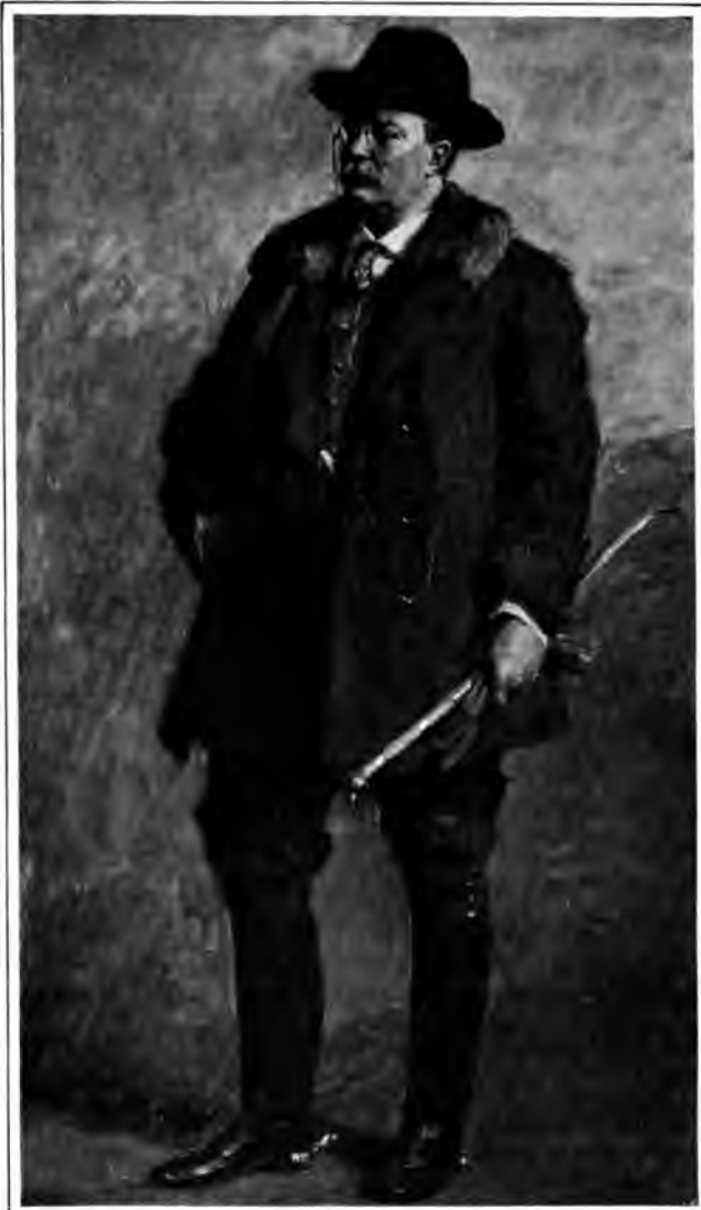
Copyright by Gari Melchers. From a painting by Gari Melchers.